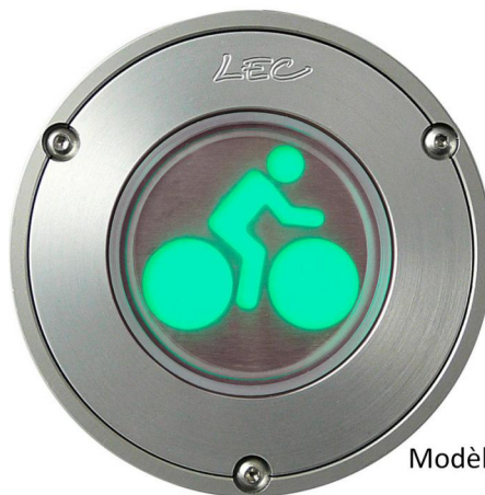
Modèle déposé (Europe)