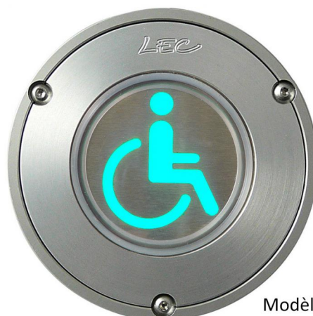
Modèle déposé (Europe)

Withstands occasional traffic from all kinds of vehicles